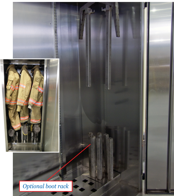
Optional boot rack

Insertion air tubes allow heated airflow to penetrate into the hanging jackets and bibs, providing superior drying performance. An optional boot rack can be inserted as tubes into the bib leg to increase directed airflow into the gear and speed drying time.